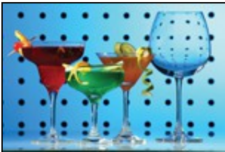
Food and Beverages